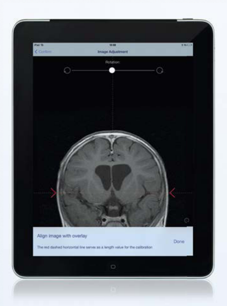
Fig. 5: THOMALE GUIDE app: Fitting the cross-sectional view into a template