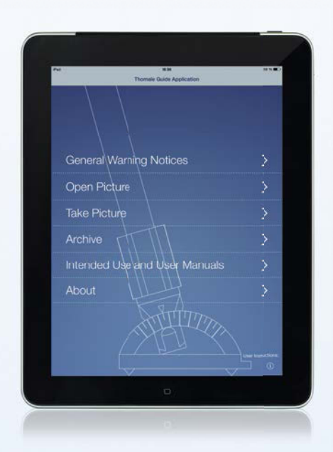
Fig. 4: THOMALE GUIDE app: Selection menu